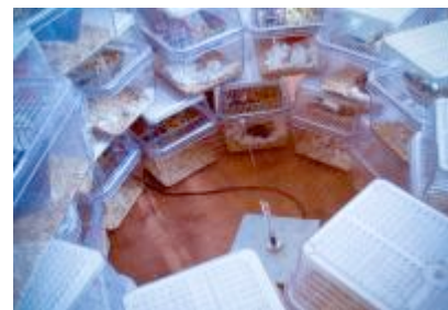
IMAGE: Mice were exposed to cell phone signals from a centrally-located antenna.

The highly-controlled study allowed researchers to isolate the effects of cell phone exposure on memory from other lifestyle factors such as diet and exercise. It involved 96 mice, most of which were genetically altered to develop beta-amyloid plaques and memory problems mimicking Alzheimer's disease as they aged. Some mice were non-demented, without any genetic predisposition for Alzheimer's, so researchers could test the effects of electromagnetic waves on normal memory as well.