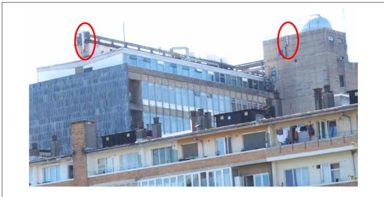
Fig. 1. The two communication masts causing most of the electromagnetic field of 70 - 100 \mu\text{W}/\text{m}^2 in one of the experimental rooms. Fig. 1. Los dos mástiles de comunicación causantes de la mayoría del campo electromagnético de 70 - 100 \mu\text{W}/\text{m}^2 en una de las salas experimentales.

Germination did not occur under 70 - 100 \mu\text{W}/\text{m}^2 . After four days, the seeds set under the two different electromagnetic field strengths already differed: those under the lower level had begun to germinate while those under the higher level of electromagnetic field had not at all done so. After seven days in total, many seeds maintained under low level of exposure had completed their germination and other ones were in the process of their germination while the seeds set under the higher level of exposure appeared unchanged (when looking at them from above) (Fig. 2 A). The experiment was continued until a total of 10 days with, at that time, the same results as above: normal germination for the seeds under low radiation, apparently no germination for those set under the higher radiation.